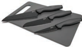
Oster® Cutlery Set Available 8/31-10/18