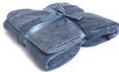
Trailworthy® Blanket Available 10/19-1/10